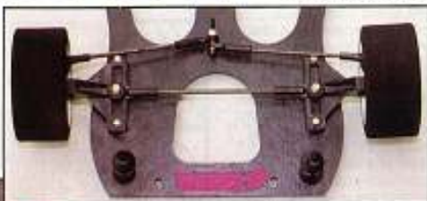
Q Front end detail.

You begin by taking the carbon fibre chassis and chamfering the battery slots to get the cells to sit as low as possible in the car, not forgetting to take the sharp edges off the underside of the chassis where the battery tape will run. I cheated here and