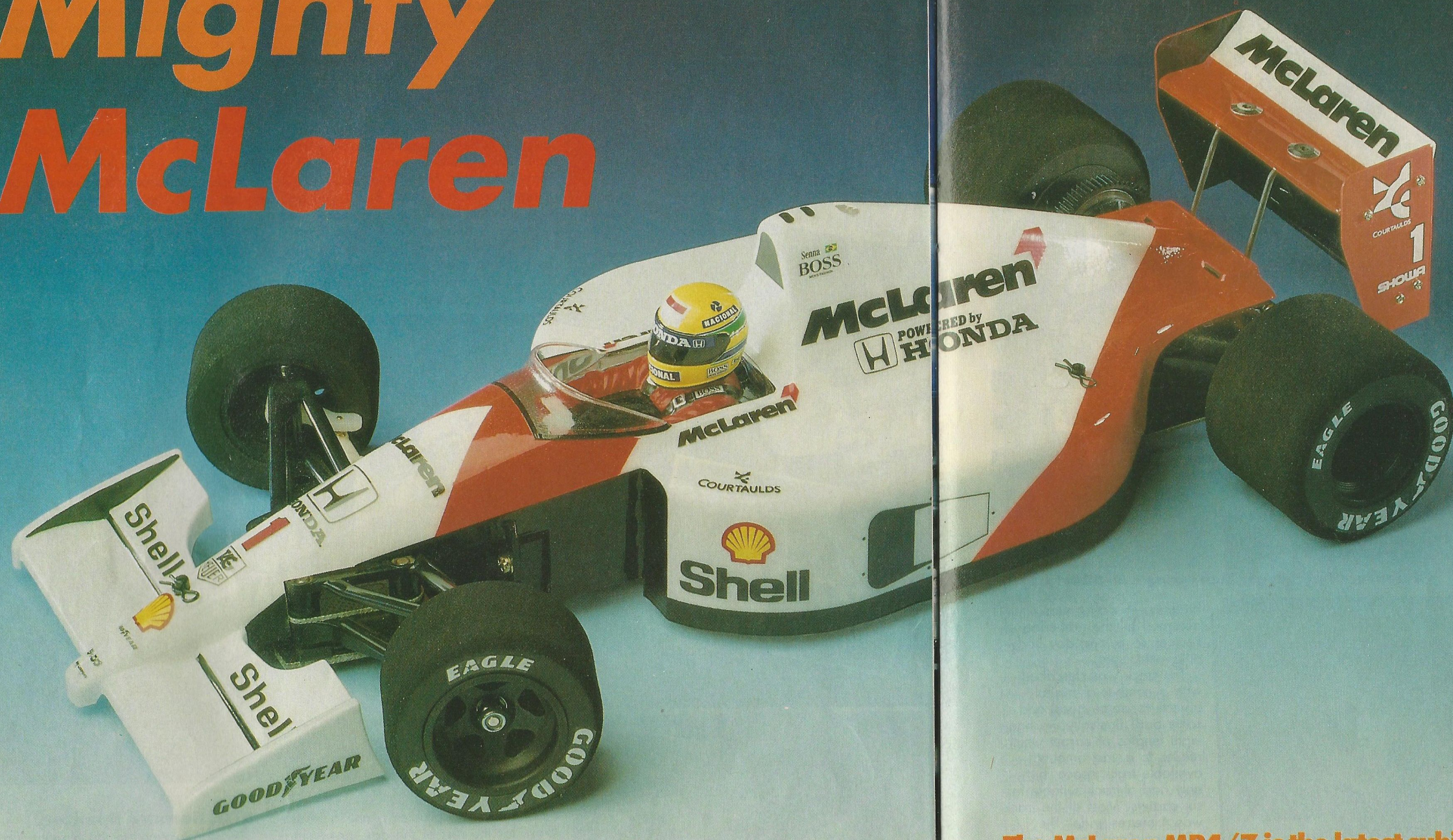
The McLaren MP4/7 is the latest subject to be included in the Tamiya F1 Line-Up

T amiya's Formula One cars have a lot going for them. They are very simple in construction, reasonably priced and when they are completed they look as they should – the real thing.