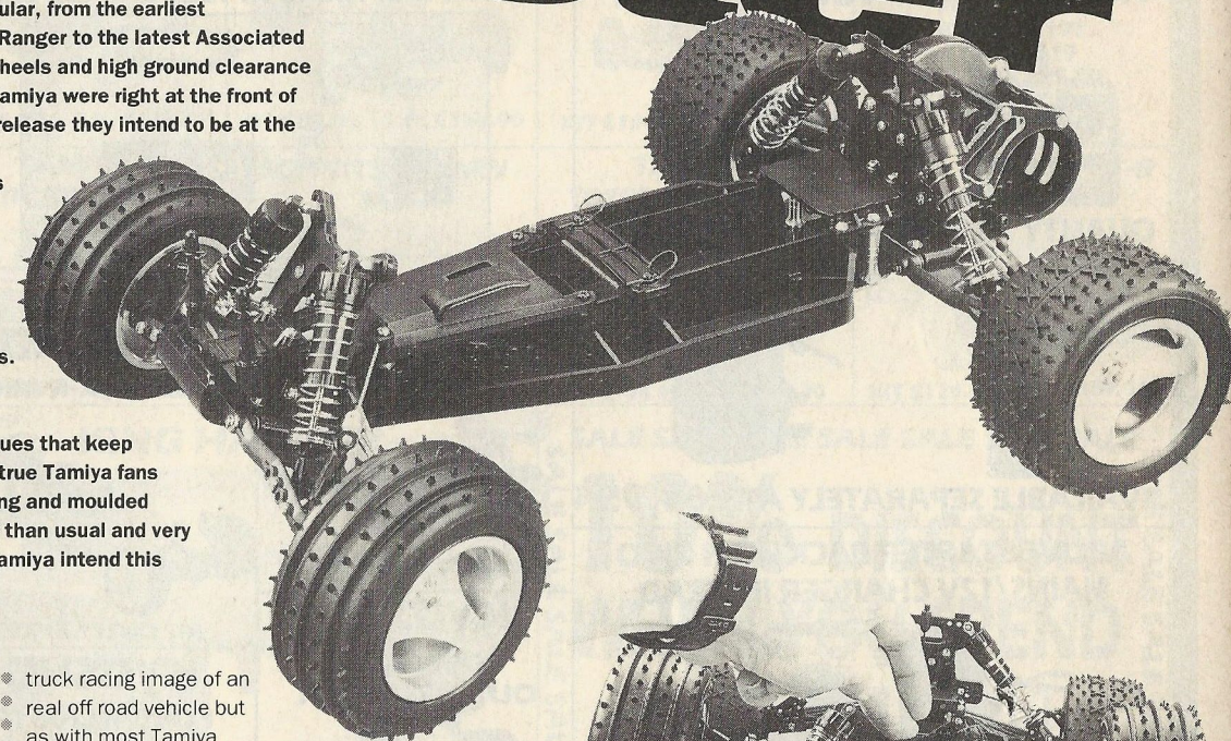
Front anti-roll bar gives the Blaster stable handling.

To top of the Blaster is a lexan moulded body. This follows the