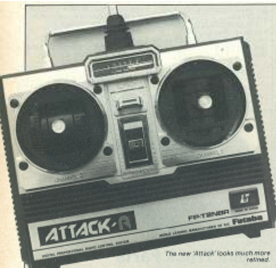
The new 'Attack' looks much more refined.

F utaba is the world's largest manufacturer of radio control equipment. The range of different types is vast and is continually being updated and modified. For some years now the major Japanese manufacturers, including Futaba have been saturating the world market with inexpensive two-channel sets. It is difficult to see where all of this equipment is going.