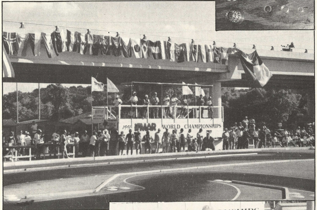
🔍 The final line up.

Although America is a large country it does not have a lot of 1/8 I.C. interest and its previous record at World events in this class had not been particularly good, but this time there was a significant improvement. One bad point though, was the fact that the rostrum had no cover to shelter