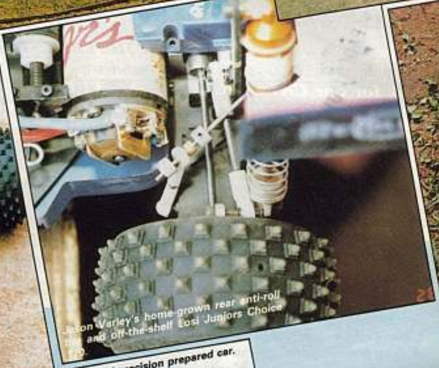
Jason Varley's home-grown rear anti-roll bar and off-the-shelf Losi Juniors Choice