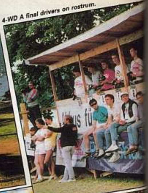
4-WD A final drivers on rostrum.