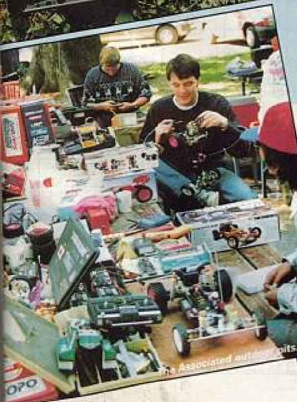
The Associated outdoor pits.