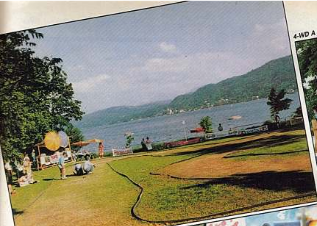
Overall view across the lake