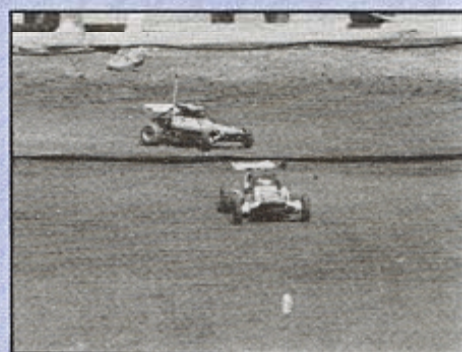
Most of the local television stations were present at one time or another with blurps shown on the evening news. A video tape of a lot of the race and the McCoy 1/10th IC race will be available later this year through the Ranch Pit Shop, 1655 E. Mission, Pomona, California 91766, U.S.A.