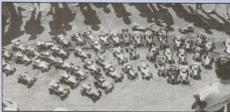
Officials at this race were very stringent with the rules. Cars must be in tech inspection prior to the finish of the race preceding theirs. If not, you didn't race. The black flag was used frequently when the cars were a hazard to others. The results of the Mains are at the end of this article. For all qualifying and Mains the AMB Computer Lap Counting System was used. In the Stock class, with stock motors and six cells, no problems were evident. With seven cells and Modified motors there were some problems even with three capacitors on each motor. A problem was also incurred when using a number 10 trans-